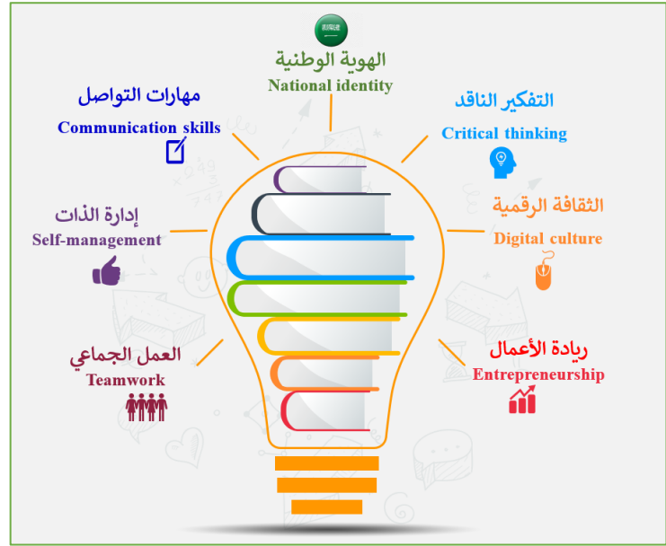
Figure 1. NBU- Graduate Attributes